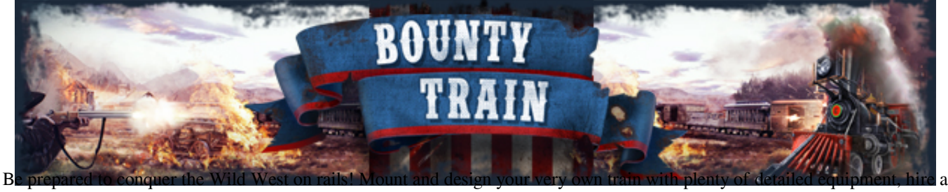
loyal, bold and selfless crew and travel through the dangerous Wild West. Find your way by cleverly using your resources and by shipping goods and passengers. Solve problems your own way, either through diplomacy, violence or bribery.

Explore the dangerous life, the accurate historic events and contemporary inventions of the North American/US 19th century. Acquire one of the most legendary steam machines and transform it into a fortress on rails. Fulfill surprising quests and face notorious bandits, vengeful Natives and even more enemies. You can only achieve this journey of your life, if you pay attention to all these thrilling factors.